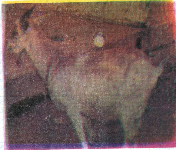
Figure 2a and b. Mange infested adult female Goat before (a) and after (b) treatment.