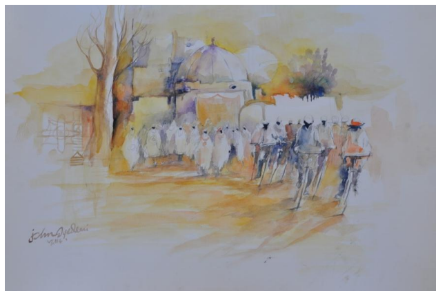
Figure 2: John Oyedemi, Setting Out , 2014.76X56cm