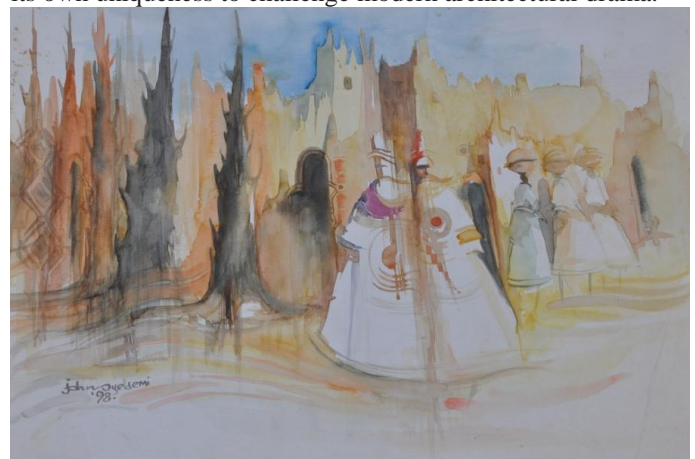
Figure 3: John Oyedemi, The Synthesis, 1998.38X56cm Source: Artist

Rebuilding the broken cities in the North in a painting is a series developed to portray the culture of the people, in terms of architecture and their activities. Some of the paintings on the local architecture were not sketched but painted directly on paper and in some instance not stretched. (See Fig.3). The traditional buildings are there for artistic and architectural understanding of its concepts as some stand as site-specific. The ecstatic of the moments of these structures is found in states-towns such as Kano, Katsina, Bauchi, Gombe, Daura, Zaria and many others. Artists found this constant changing pieces/icon and disappearing images inspiring to interpret in their own way and create new ideas out of them. The visual saturation of these structures in some instance represents our culture and what civilization could not take away. The visual landscape is not affected by the world around it but maintains its own uniqueness to challenge modern architectural drama.