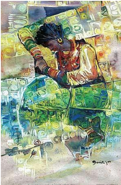
Plate 3: Sam Ovrati, Woman in green 1991 watercolour 53 x 35.5 cm. (20½ x 14 in.)

(2011), avers that, Sam Ovrati widely known as the most expressive water colourist in Nigeria, has the ability to not control the medium he works with but instead to speak the language of the medium, letting the medium dictate the artwork.