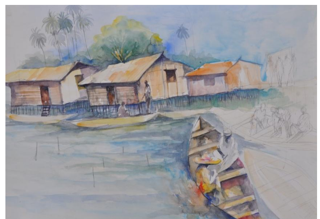
Figure 1: John Oyedemi, Waterside, 2014. 76X56cm

An idea in critical perspective of narrative events in the practice of watercolour is an attempt to depict visual poetry of daily activities in different panoramic manner. There are so many stimuli around the artist for creative contemplation – Markets, Streets, People, Buses, waterside, Bicycle riders, and green spaces. (See Figs 1). Waterside is one of the interesting places to paint for an artist when looking for subject matter. It has the attribute for artistic meditation and contemplation, the boats, people, and shanty houses. In realization of this, the compositional structure of paintings in this paper captures the rhythm of practices in watercolour that seems not to generate much interest in contemporary Nigerian art scene. It is evident in most recent exhibitions, galleries and public places that watercolour is becoming an art for the kids or beginners. Also, emphasis on practice in schools of art seems to give credence to this position.