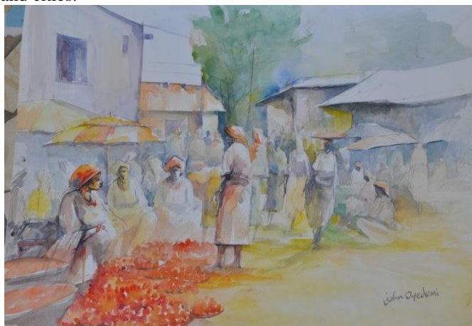
Figure 4: John Oyedemi, The Market setting , 2014.76X56cm

The common the denominator noticed in the practice of watercolour in Nigeria is the ineptitude of artists to green spaces despite the lushness and its aesthetics. Most watercolour paintings depict people in activities in villages and cities.