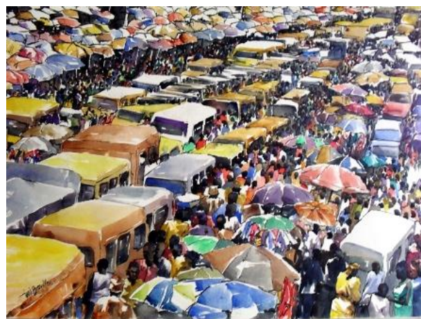
Plate 1: Water Color Painting of Lagos frenzy 2013, Ini Brown

A write up on Ini Brown in 2015, describes him as, 'unarguably the most versatile and prolific Watercolourist in recent times to have graced the Nigerian and African art scene. His creativity, ingenuity and dexterity with the watercolour medium is simply breathtaking. His unique technique in the dramatic use of watercolor is awesome'. ( http://www.artpal.com/brownini4 ).