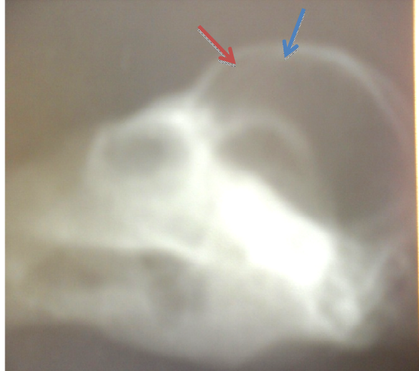
Plate II: Lateral view of first trimester fetal skull showing radiolucent calvarium (red arrow) and anterior fontanele (blue arrow) [Magnification ×125]

The calvaria of the first trimester fetuses had clear fontaneles. appearing radiolucent on the radiographs (Plates I & II), and the fontaneles tended to disappear with advancement in age at the second and third trimesters stages (Plates III & IV). The radiographic findings revealed the prominence of the anterior fontanele which appeared translucent (dark) with a relative radio-opague (white) surrounding at the level of first the trimester aged fetuses. There was slight radio-opacity of the calvaria in the first and second trimester fetuses relative to the third trimester fetuses at which stage radio-opacity became more widespread and progressively prominent. Fetal heads at third trimester had greater radiopacity which appeared much whiter on the radiographs (Plate IV).