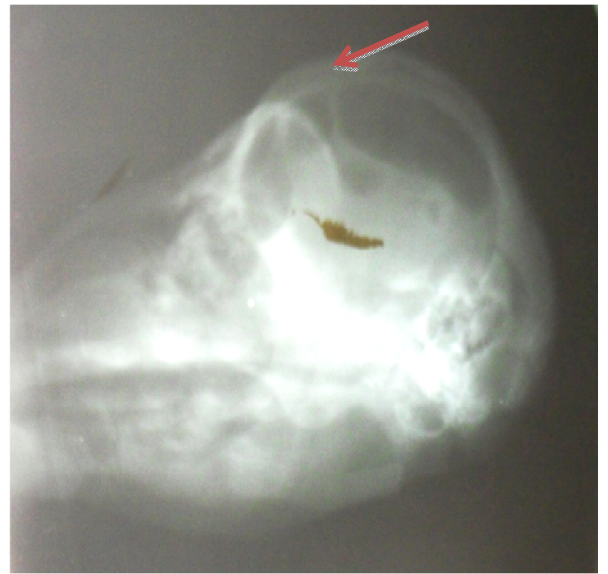
Plate III: Lateral view of second trimester fetal skull showing radiolucent calvarium (red arrow) [Magnification ×125]