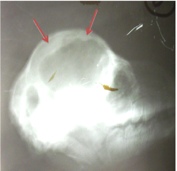
Plate IV: Lateral view of third trimester fetal skull showing a relative radio-opacity of the calvarium indicating heavy calcification (Red arrows) [Magnification ×125]

A radiographic picture of the head is a valuable aid for diagnostic purposes and for research concerning the growth of the head in humans and animals (Anonymous, 2011). In many instances, a radiograph of the head according to Shojaei et al., (2008), is used as a representation of the bony and soft tissues of the head; however, the soft tissues as well as the complex arrangements of numerous structures of the head may influence the measurements of the bony parts, thus making a radiographic anatomy of the head region difficult to understand. This