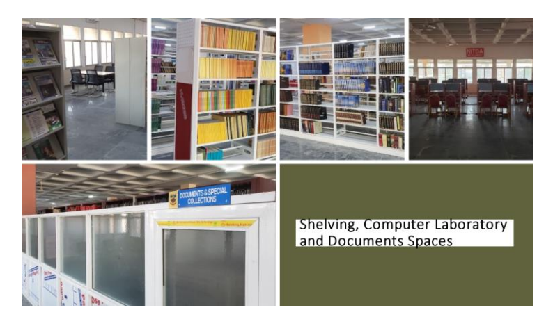
Figure 8: Renovated interior