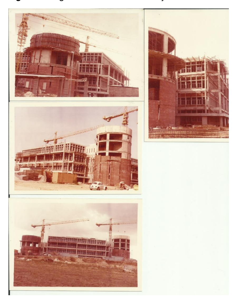
Figure 4: Progress of work on new library 1984